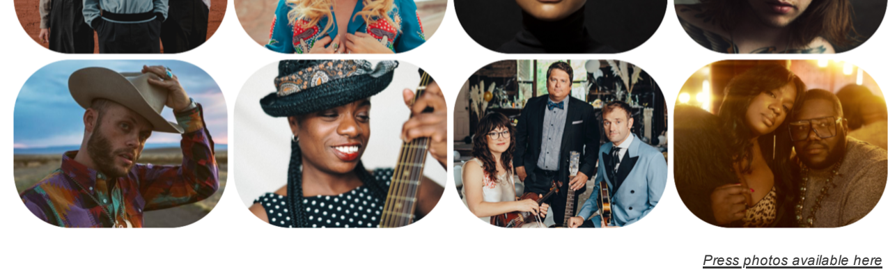
Press photos available here